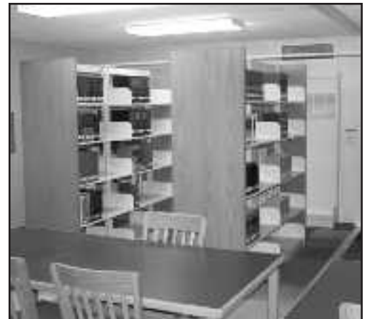
Another view of the current library at William Carey College.