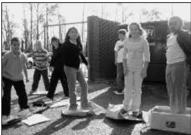
The Stomp the Box activity proved to be great therapy for students.

Anniston Avenue Elementary School will be forever grateful to generous booklovers from across country. Books of every genre, in all conditions – from the new purchase to the gently loved to the well-loved book – were given from the heart. The donors gave and gave, from the child who chose a favorite book from a personal collection, to the people in Phoenix, Arizona, who sent an eighteen-wheeler with thirteen pallets of books that had been collected, organized, and shipped by a Boy Scout working on his Eagle Badge project. Donors drove from Maine, Ohio, and South Carolina just to bring books for our children. School librarians donated their book fair profits, students collected money and bought books, and teachers forfeited their classroom wish list gifts. We were adopted by so many kind and generous readers – too many to name them all, but we have a wall of fame for them. Without all these lovers of books, our students would have been without books. ■