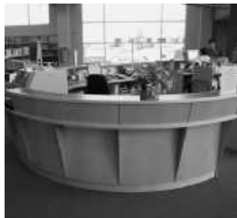
Wagner Branch Library

GN Associates, Inc. 1349 Lakeshore Drive Metairie, LA 70005