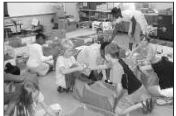
Students covered boxes with paper to make temporary box "shelves."

And then the frequency of the donations increased. The hard-back books that met the collection development policy of the library were re-boxed and pushed into a corner. When the corner was full, an empty textbook storage room was found. Books that did not meet the requirements of the collection development policy