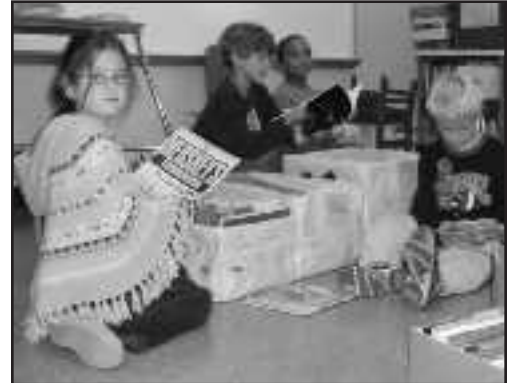
Students sort donated books.

What were we to do with all these books? The library had no furniture, no shelving, no computers, no automation system, and most importantly, no existing collection. But there were books in those boxes. The next question: What do you do with classes that come to the library every forty minutes? You have them help you sort and organize books. Students unpacked boxes. They separated fiction from non-fiction and sorted books