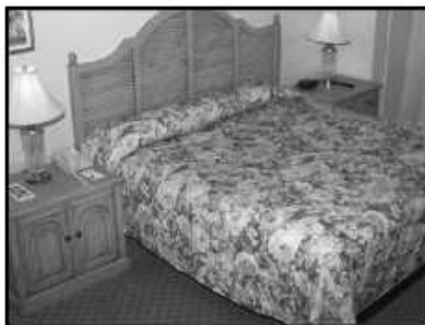
Veranda King Room