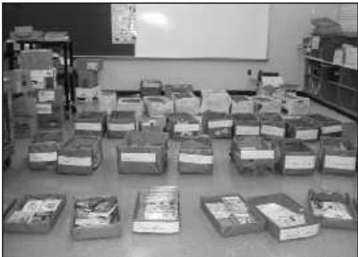
Anniston Avenue Elementary's temporary library.

renovated. The mold was removed, new carpet was installed, new paint was on the walls, new light fixtures were in place, and new ceiling tiles were installed. Furniture and shelving had arrived and were installed. How did we move the donated collection to the library? With help from the students, of course. The students were thrilled to move the cardboard boxes of books to the library. The donated books were transferred to the shelves, and the students had a stomp-the-box party when everything was moved. "Stomp the box" was great therapy for them – they were able to take out their frustrations on those boxes.