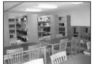
The new library reading room at the newly opened temporary campus of William Carey College on the Coast in Gulfport, Mississippi.