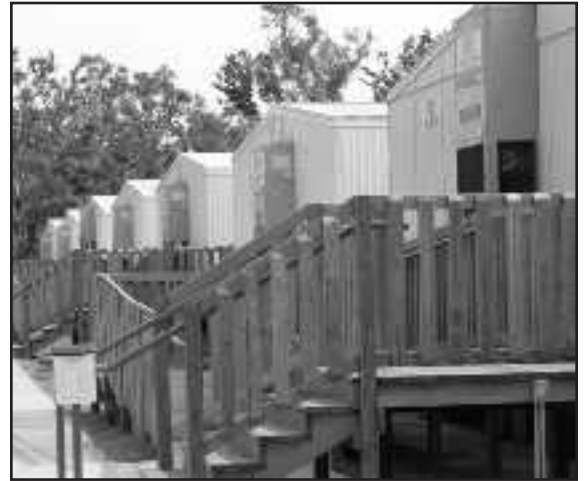
Doublewide trailers are being used for classrooms at William Carey College in Gulfport. The library is in two of the trailers at the end of the row.

The William Carey College on the Coast Library officially reopened for the summer session in two doublewide trailers on the soccer field behind the original campus buildings on Beach Boulevard. Classes are being taught in sixteen modular buildings on the temporary campus that the library now serves. The library itself has $75,000 of new furniture and shelving to house the 6,500 books that were rescued from the old facility post-Katrina. Donations totaling $35,000 have been