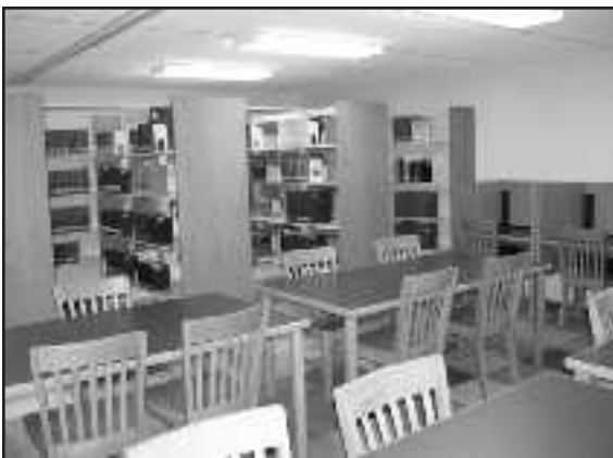
The new, temporary library reference area at William Carey College in Gulfport. Most of the books pictured were salvaged from the old library.

received to purchase books to replace those lost in the storm. Librarian Peggy Gossage is very happy to be back in a facility on the Gulf Coast after driving back and forth to the main campus in Hattiesburg for over eight months. The students seem very grateful to have access to the library and its $10,000 worth of new computer equipment purchased with grant money from the National Network of Libraries of Medicine and the Mississippi Humanities Council. A replacement campus, complete with a new library building, is in the planning stages and will eventually be built at a location north of I-10.