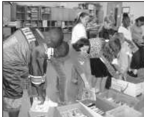
Students at Anniston Avenue Elementary School sort donated books by genre.

either alphabetically by author or numerically by Dewey. They covered boxes with bulletin board paper and decorated them according to topics, and those boxes became the new library shelves. The boxes were arranged on the floor according to Dewey classes or alphabetically for Fiction and E for "Everybody Books."