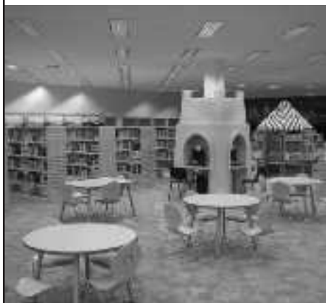
Dunedin Public Library