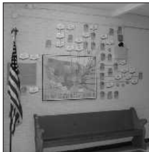
A Wall of Fame was established in honor of everyone who donated books to Anniston Elementary. This picture shows the Wall of Fame in its early stages.