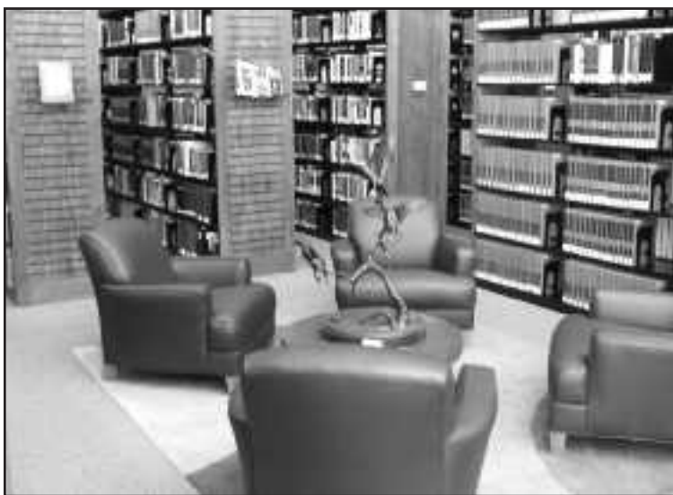
The replacement and relocation of the bookshelves enabled the library at MGCCC-Jackson County to change its layout, affording a larger student study area upstairs.