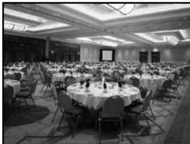
Conference facilities are adjacent to the conference hotel, separate from gaming area

(*Long distance rates may apply. Wireless available in the hotel lobby.)